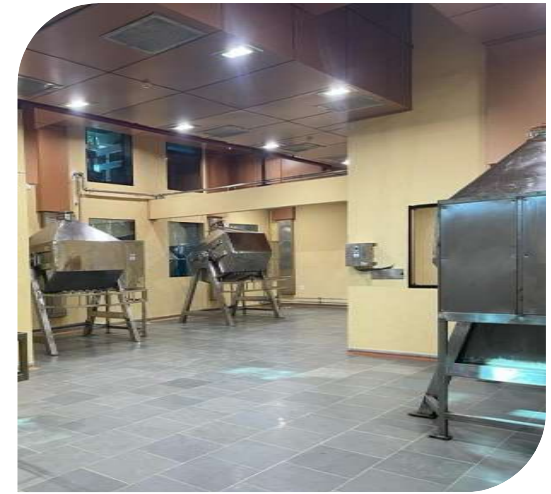
Proto Chemical Industries Factory - Tarapur

SUSTAINABLE & ECO FRIENDLY MANUFACTURING PROCESS